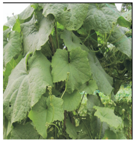
Figure 1: Male sterile tissue culture plant during anthesis