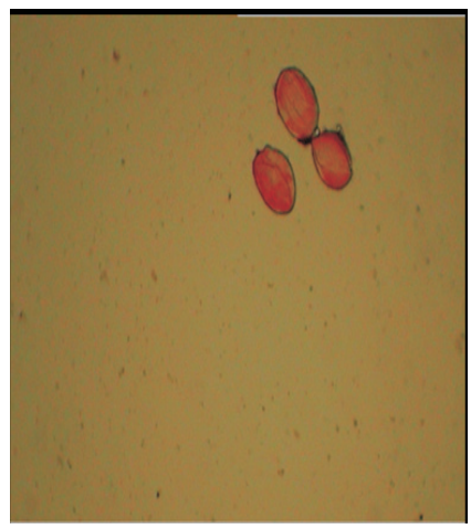
Figure 4: Male sterile pollen during anthesis

presence of two fertility restorer genes in Arka Sumeet viz Rf1 and Rf2.