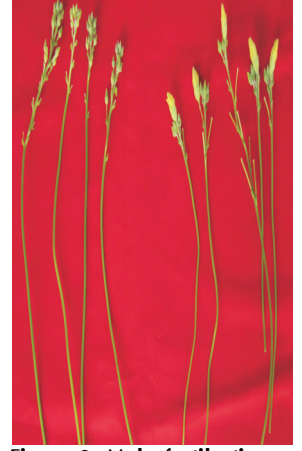
Figure 2: Male fertile tissue culture plant during anthesis