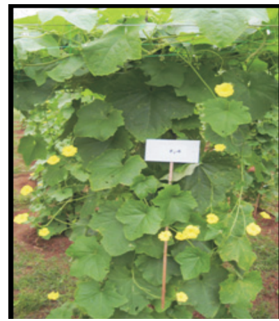
Figure 3: Racemes of both male sterile and fertile plant